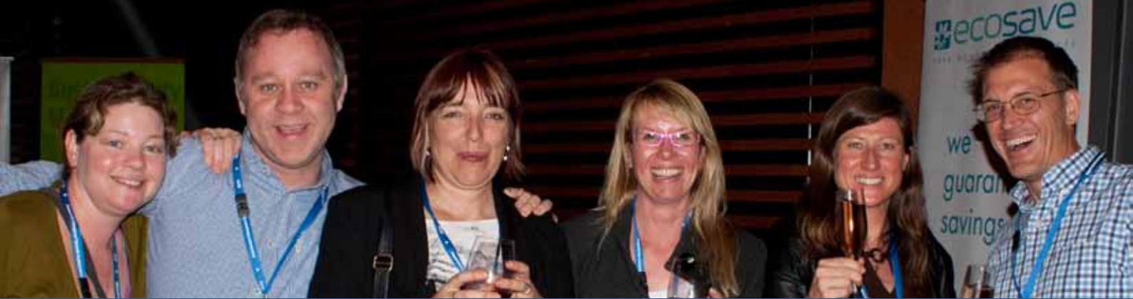
Delegates at the 2011 ACTS Conference Dinner

The conference wrapped up with a sector update and a LiFE Performance Management Tool overview at the University of Adelaide on Friday 30 September. Some delegates chose to kick off the long weekend by attending one of two conference field trips – a sustainability tour of Adelaide or a biodynamic winery tour in Norton Summit.