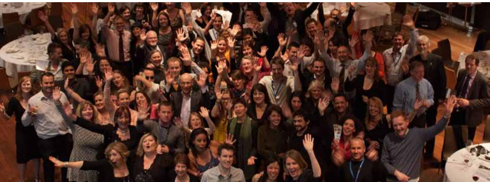
Delegates at the 2011 ACTS Conference dinner

The 2011 ACTS Conference was hosted by the University of Adelaide at the National Wine Centre, South Australia, between 28 - 30 September. The theme for the conference “Sustainability as Core Business: Building the Case for Change” aptly addressed this challenge faced by the tertiary sector by exploring how sustainability fits into core business and providing tools and techniques to enable the required change.