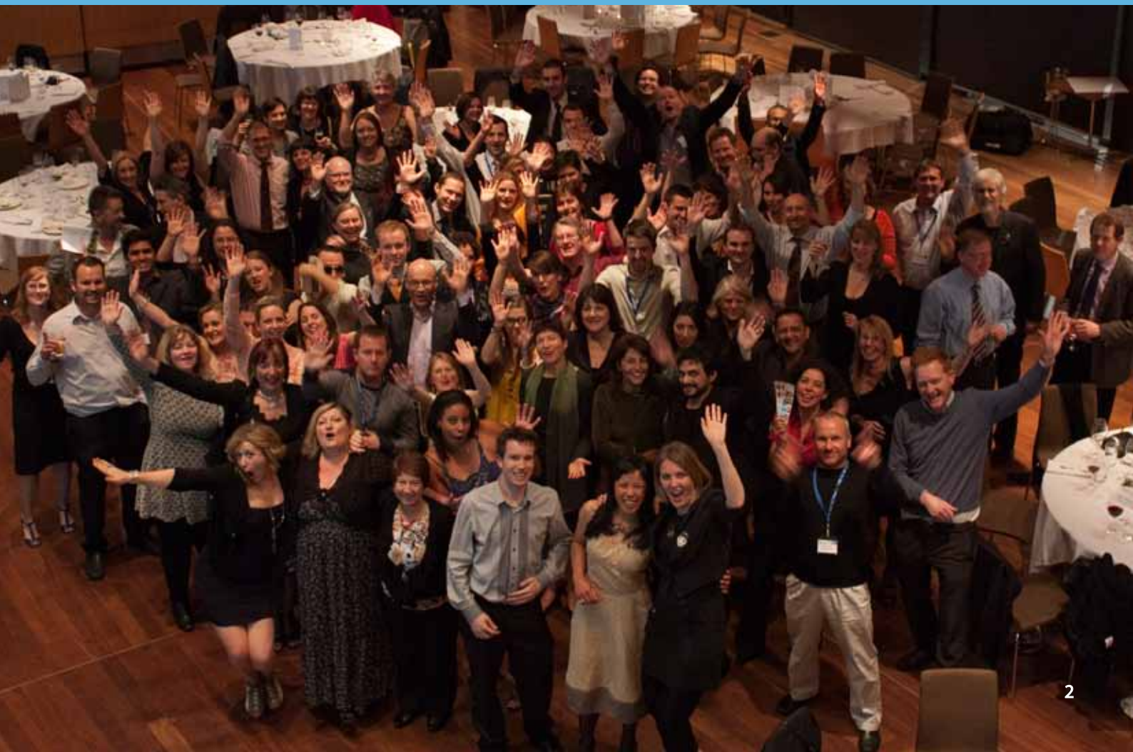
Delegates at the 2011 ACTS Conference dinner