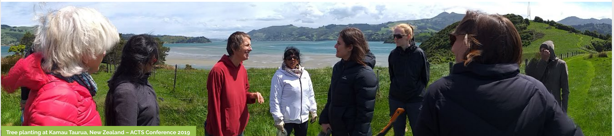
Tree planting at Kamau Taurua, New Zealand – ACTS Conference 2019