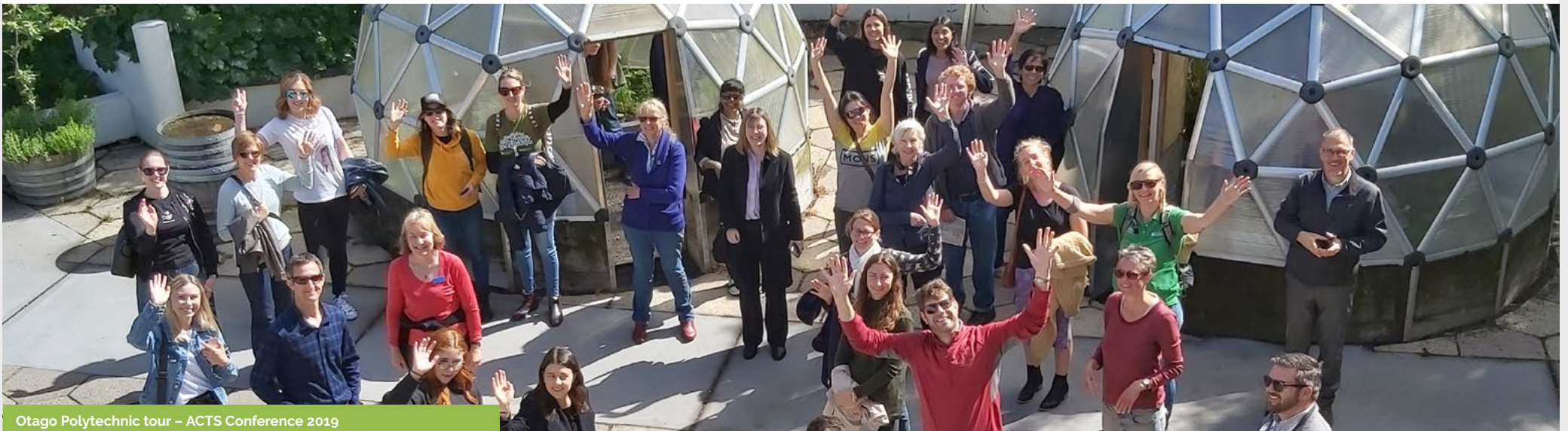
Otago Polytechnic tour – ACTS Conference 2019