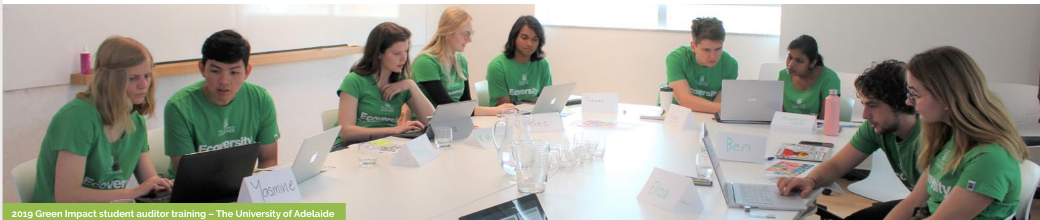
2019 Green Impact student auditor training – The University of Adelaide