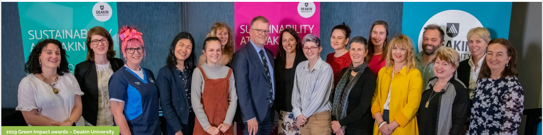
2019 Green Impact awards – Deakin University