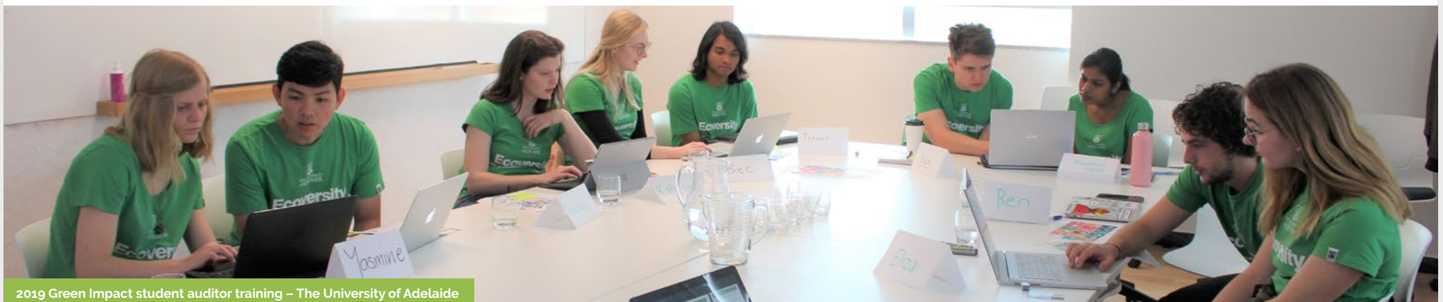
2019 Green Impact student auditor training – The University of Adelaide